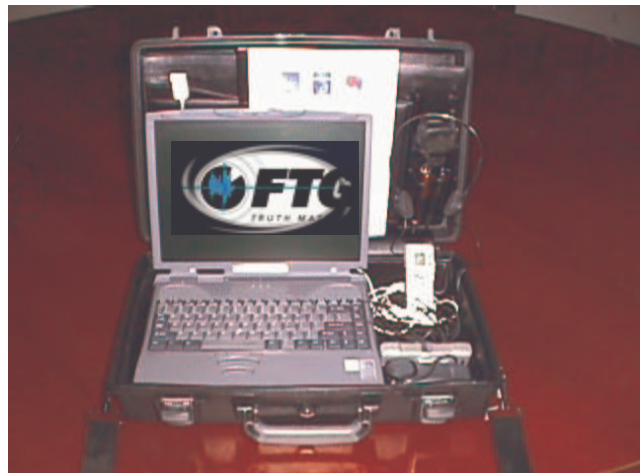
DVSA Full System Package

Forensic Voice Analysis has been embraced by over 1500 state & federal Police Departments in the United States of America and used by the Department of Corrections, Intel & the Military. Our systems have also proven a very reliable investigative tool for determining the validity of allegations made against police officers.